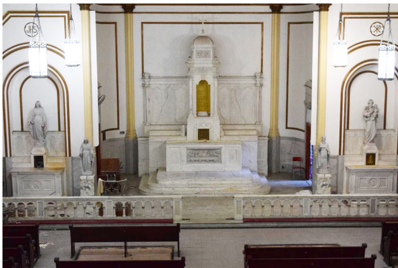
The marble high altar, side altars, and altar rails before being shipped to Jacksonville from a closed church in the Bronx, New York.