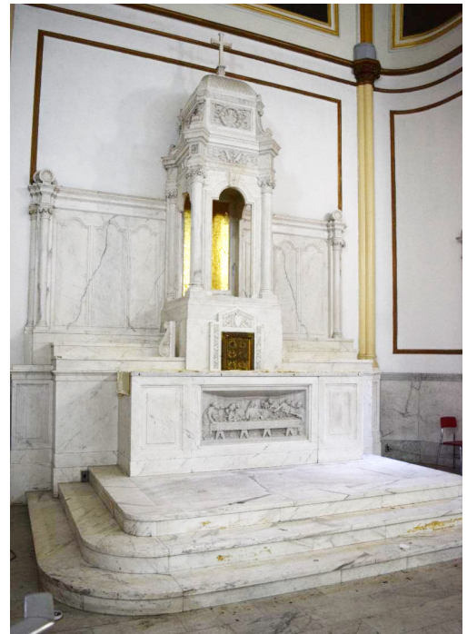
A detail of the High Altar.

The fervent desire for the traditional Latin Mass caused many Roman Rite Catholics who attended Divine Liturgy to reach out to the SSPX in the early 1980's. As this was early in the Society's mission, there were not enough priests available for a consis-