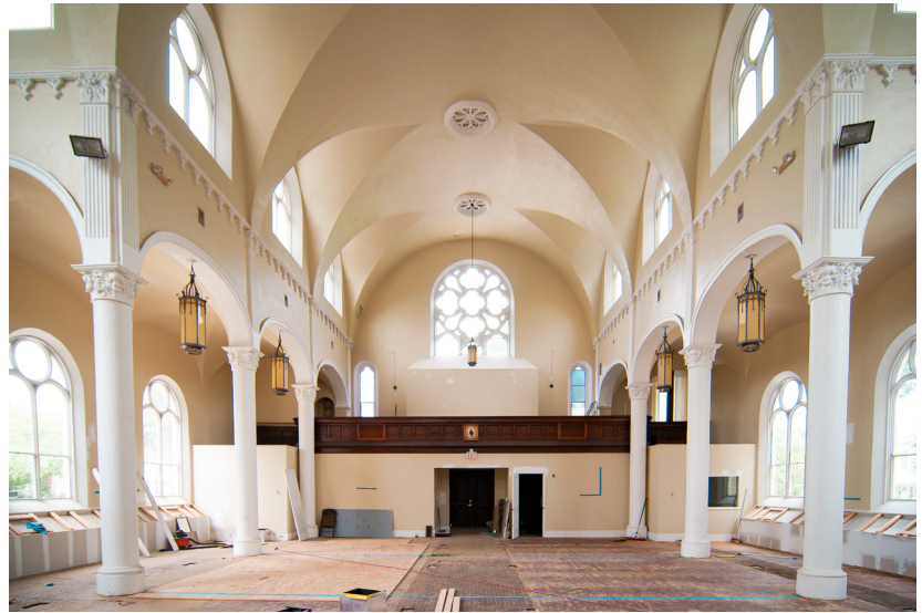
A view of the rose window from the sanctuary. The original fixtures and crown molding will be preserved.

Pompeii Rising’s mission to revitalize Old Holy Rosary is not just for the physical edification of a building but an opportunity to harvest the fruits sown by the Martyrs of La Florida and Blessed Bartolo Longo. The intertwined destiny of North Florida and Pompeii, Italy finds new expression as Our Lady of Pompeii Catholic Church rises from the ashes, a testament to the enduring power and intercession of Our Lady of the Holy Rosary of Pompeii.