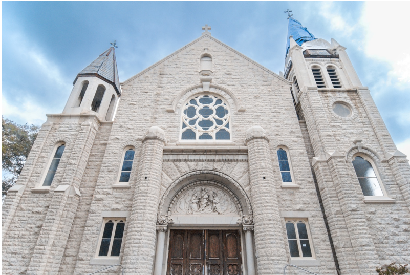
West facade of Our Lady of Pompeii

would die before the promulgation of the Novus Ordo Missae.