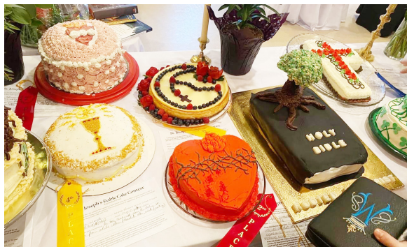
St. Joseph's Church in Ray Township, MI held its 4th Annual St. Joseph's Table event in honor of its patron, complete with traditional breads, pasta, a live auction, and the annual cake decorating contest.