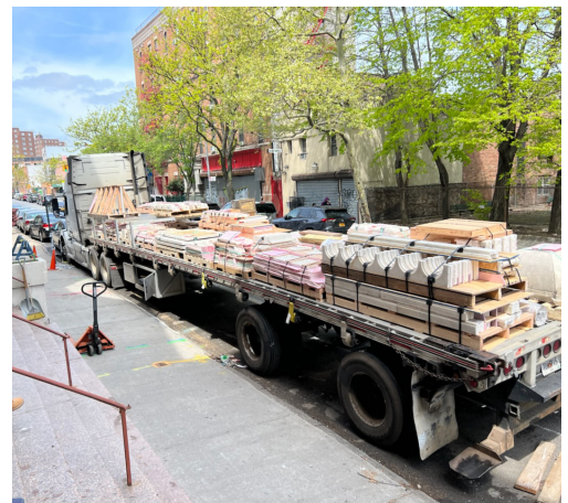
The altar being shipped to Jacksonville, where it is currently in storage awaiting installation.