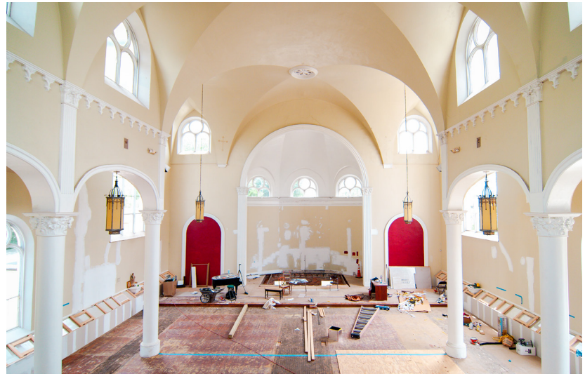
The before view from the choir loft.

Consider contributing to this sacred endeavor