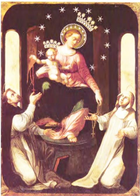
Image of Our Lady of the Rosary of Pompeii. This miraculous image was once transported in a dung cart before it was restored and venerated.

Meanwhile in Italy, in the desolate valley of Pompeii, a captivating turn in history occurred. Once a fallen away Catholic and former Satanist, Bartolo Longo came back to the Faith, and in 1875, discovered a miraculous image of the Blessed Virgin and the Child Jesus giving the Devotion of the Holy Rosary to St. Dominic and St. Catherine of Siena. This image became the focal point of a pontifical shrine in Italy known today as Our Lady of the Rosary of Pompeii. The ancient city of Pompeii, rising from the ashes of Mt. Vesuvius through the transformative power of love, mirrored events about to unfold in Florida, solidifying the intertwined destiny of these two spiritually connected locations.