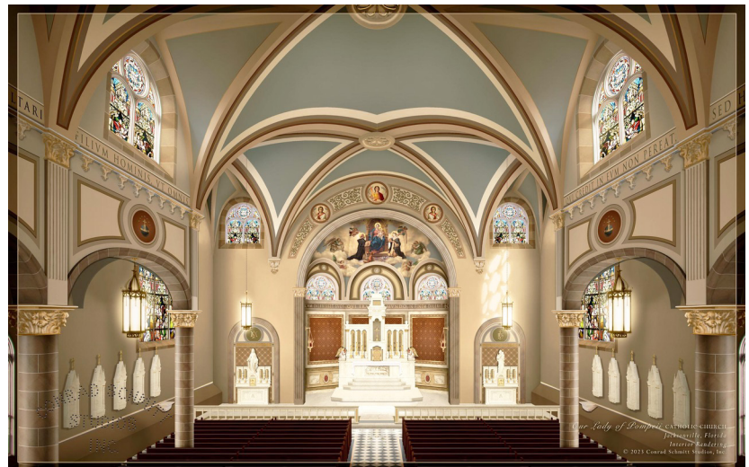
The after view from the choir loft. This concept art was commissioned from Conrad Schmitt Studios.