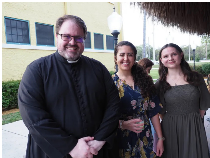
Our Lady of Victory and the Shrine of St. Philomena recently held their fourth annual fundraiser gala to raise funds to build a new church.