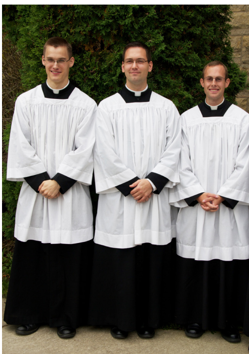
Joyful brothers following the 2015 Michaelmas celebration.