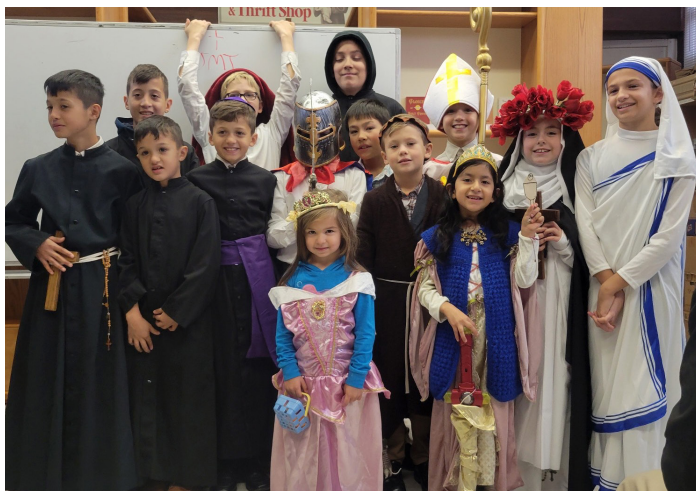
Children from St. Anthony of Padua Church in Caldwell, NJ celebrated All Saints Day by dressing up as their favorite heroes of the Faith.