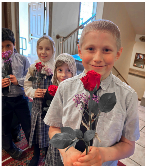
Our Lady of Good Success is the Patroness of St. Michael's Chapel (DePere, WI). In honor of her feast day (February 2nd), the academy children brought her flowers in a special procession.