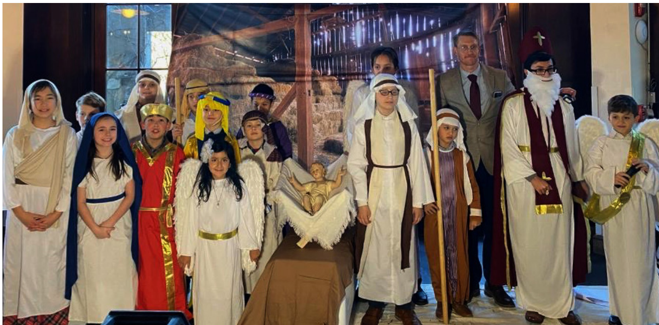
St. Anthony of Padua in Caldwell, NJ held a Christmas pageant this year to add to their celebration of the feast.