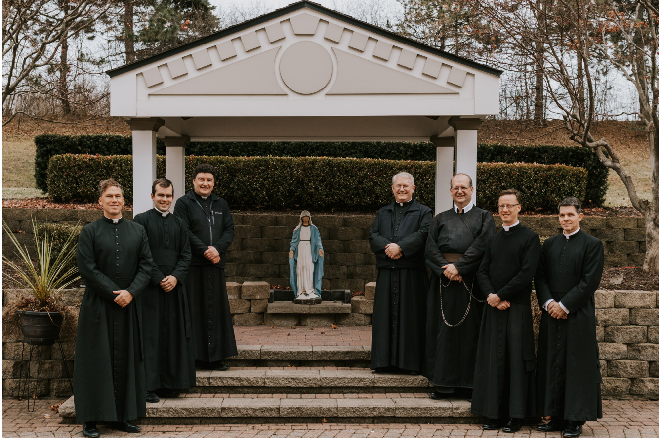
The priests take time for a photo shortly after the conclusion of the event.