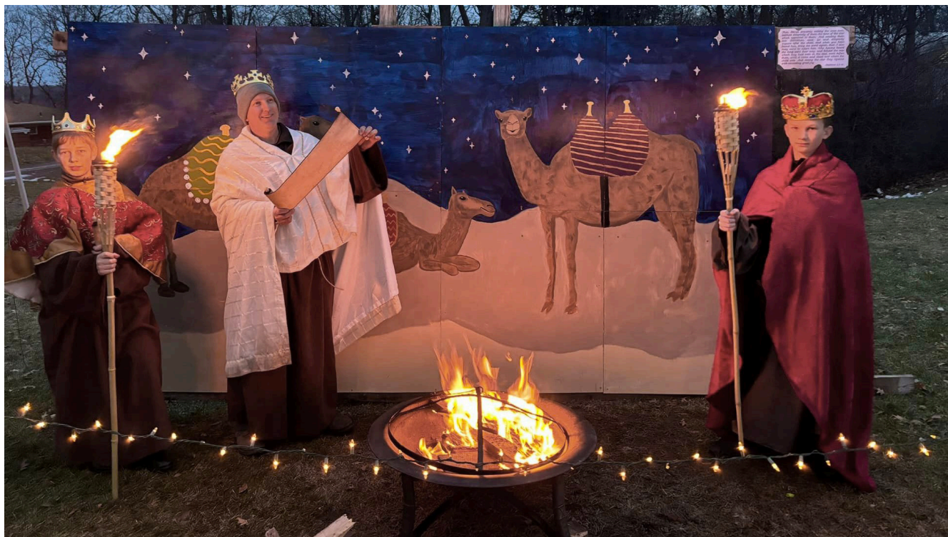
St. Michael's Chapel in DePere, WI hosted a live Nativity scene in December 2023. They were blessed with mild weather that weekend and the event was a big success. Many parishioners donated their time and talent—from sewing costumes and building the sets, to acting as the Holy Family, angels, kings, shepherds, townspeople, etc. It was attended by parishioners as well as area residents and friends. They also had live sheep, donkeys, and steers in the stable, replicating as much as possible the cave at Bethlehem.