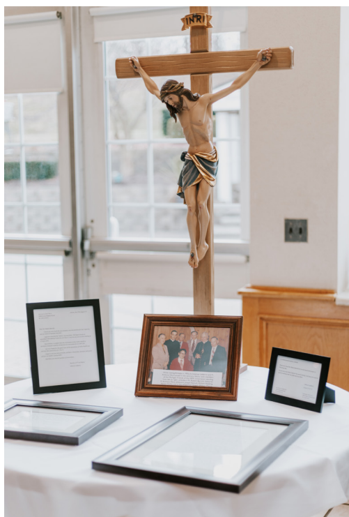
Framed correspondence from Archbishop Lefebvre dating back to the time of the foundation of St. Anne's.