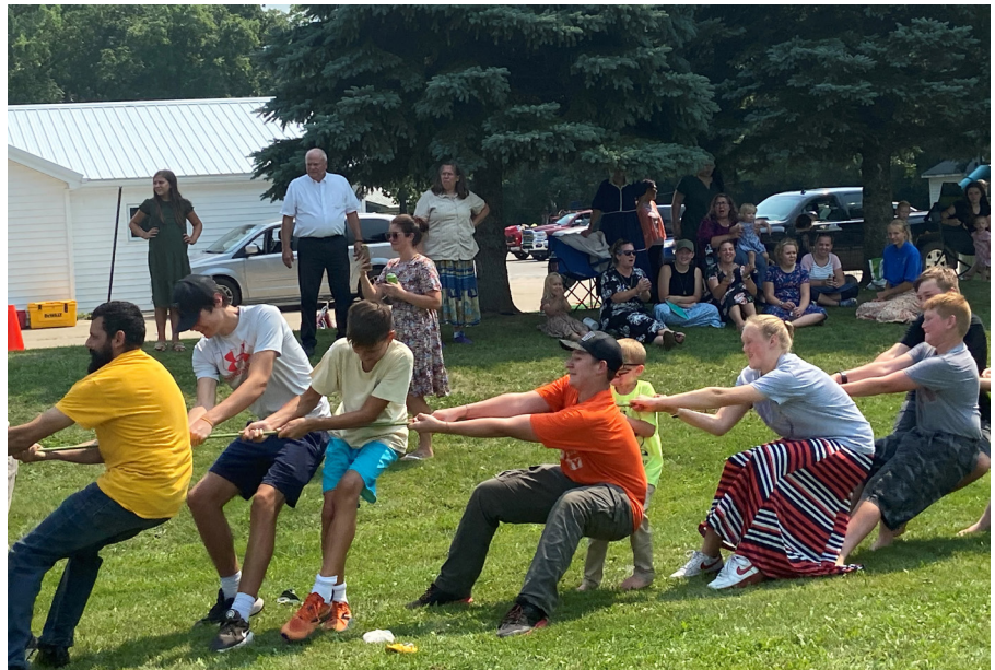
St. Michael's Chapel, DePere, WI held their annual Parish Picnic on August 20th. Festivities included a Tug of War, zipline, bounce house, football, volleyball, an ice cream treat, raffles, and more. There was also plenty of time to enjoy good food and conversations with fellow parishioners.