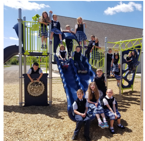
The kindergarten students on their new playground. (far right)