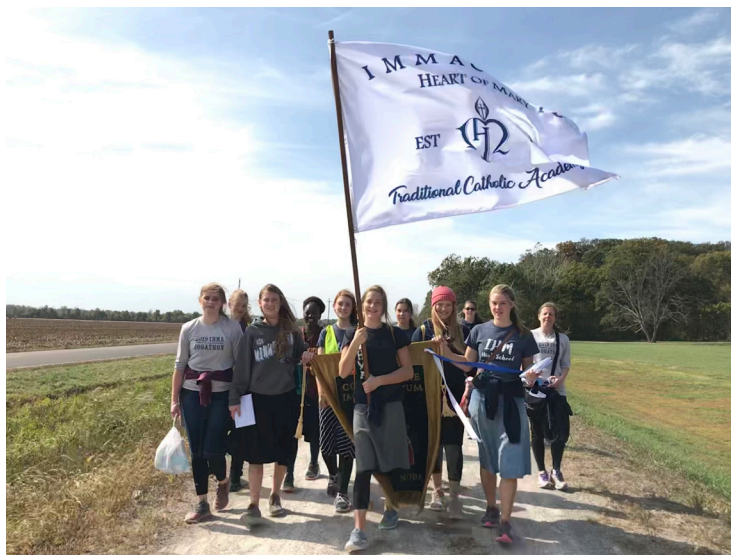
IHM high school girls have attended the Starkenburg pilgrimage since 2004.