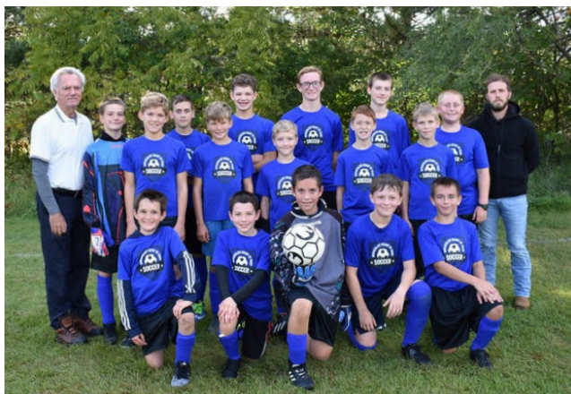
IHM Academy's middle school soccer team—the school's first official sports team—went 4-0 in its inaugural season this fall.