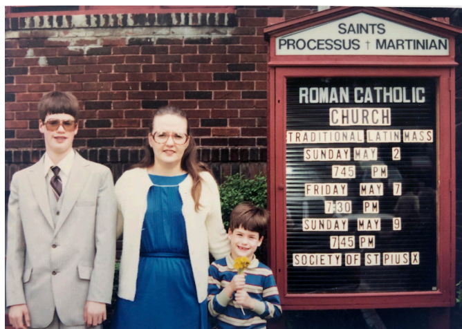
The IHM mission chapel was originally named after Sts. Processus and Martinian before the church was taken by “The Nine.”