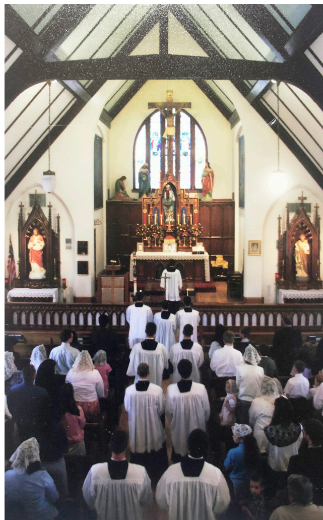
St. Thomas Aquinas Seminary visited IHM in 2007 (left).