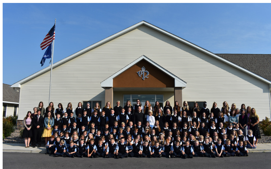
Top right and center: IHM Academy and the IHM Academy chapel.