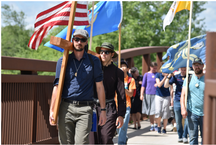
St. Robert Bellarmine Chapel in St. Cloud, MN sponsored the July 28-29th pilgrimage to the Grasshopper Chapel in Cold Spring, MN. (left)