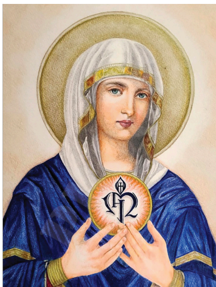
A custom image of Our Lady was drawn by an IHM parishioner for the occasion of the priory inauguration.